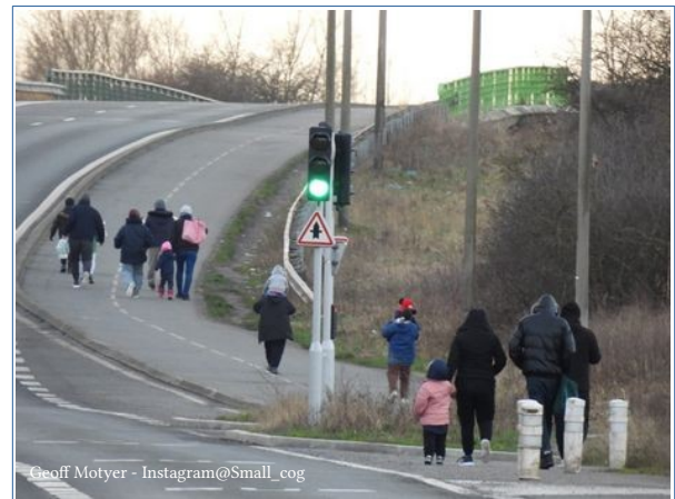
Geoff Motyer - Instagram@Small_cog