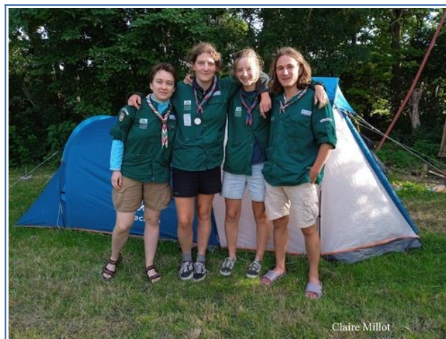
Then the Compastagas: Pictured in front of their tent