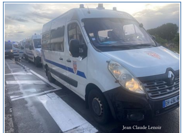
City center on 26 th August.

They are not heavily armed. The HRO reports shields on 1 st August (as well as a rifle of an unknown kind – pictured below – and a gas mask!), on the 20 th and 22 nd too (as well as a "multi-shot" weapon on the 22 nd , and a large LBD on August 4 th ).